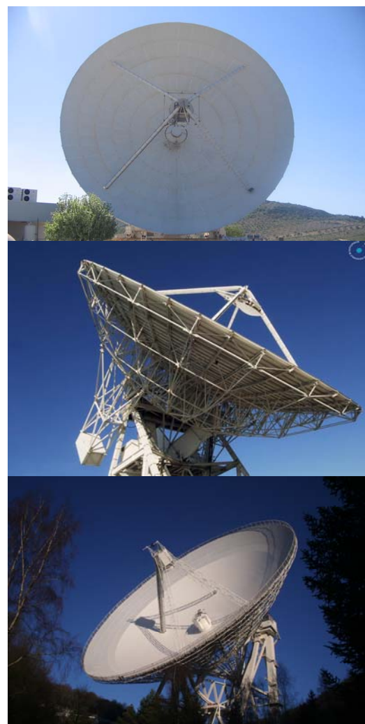
From the top: the Noto, Medicina and Effelsberg radiotelescopes

Data acquired by the Italian antennas were post processed with the Advanced Software Tools for Radio Astronomy (ASTRA) developed by our group. Data collected at Effelsberg were analyzed with the CONT2 subpackage of the Toolbox package for the analysis of single-dish radio observations.